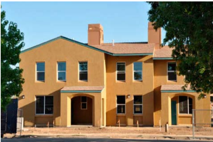
Compact Single-family development