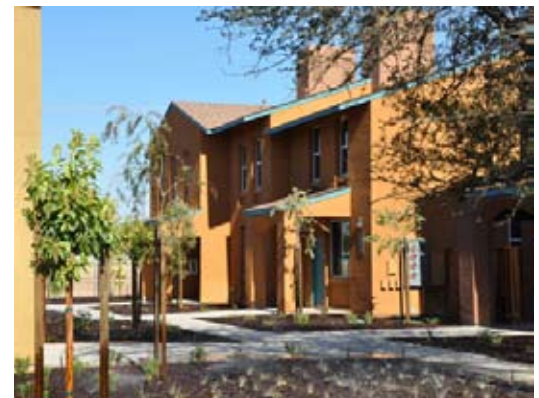
Old and new growth integration