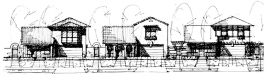
Compact single family development