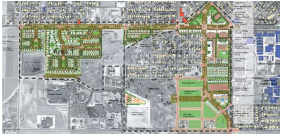
Illustrative Master Plan