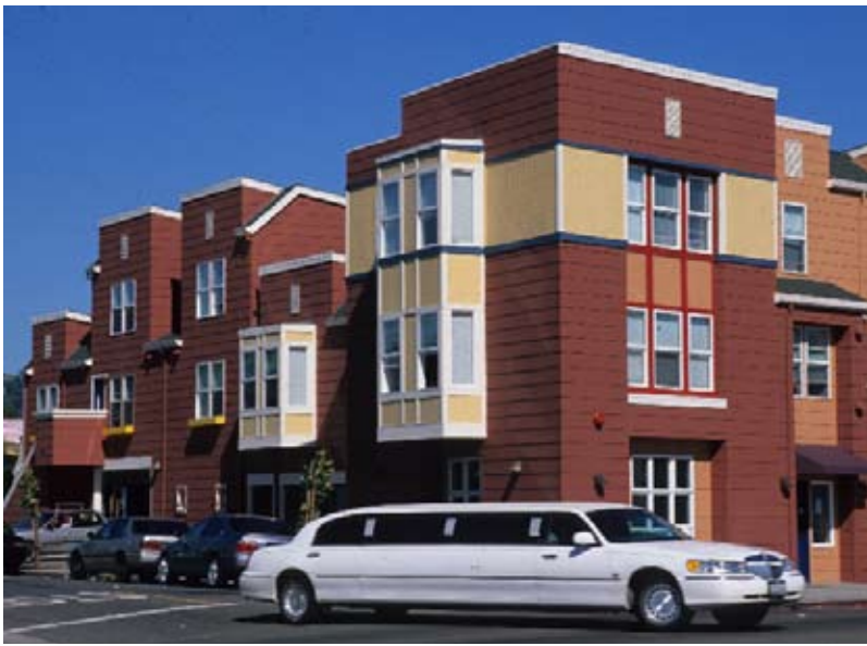
Deborah Muse Manor: 7 units

A corner building includes townhomes above a non-profit organization's office. The building massing surrounds a secure courtyard for children. Family townhomes are above a parking garage along the side street.